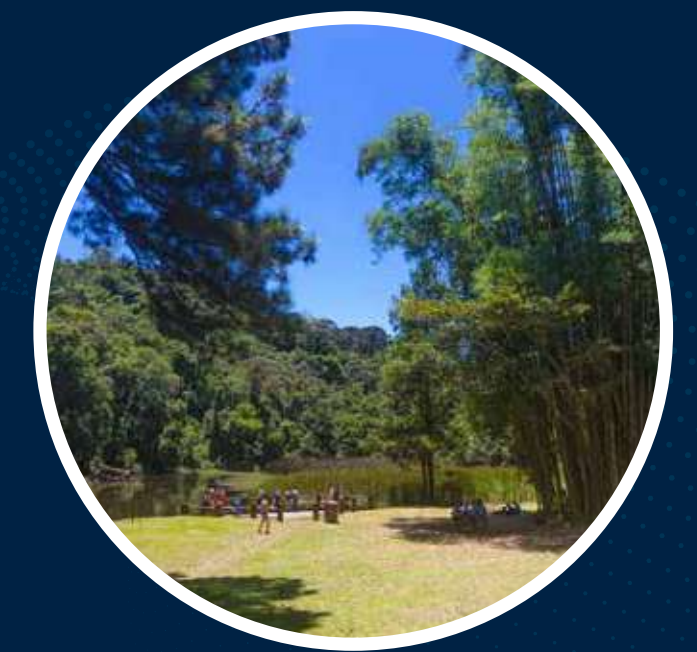
CANTAREIRA/ HORTO FLORESTAL