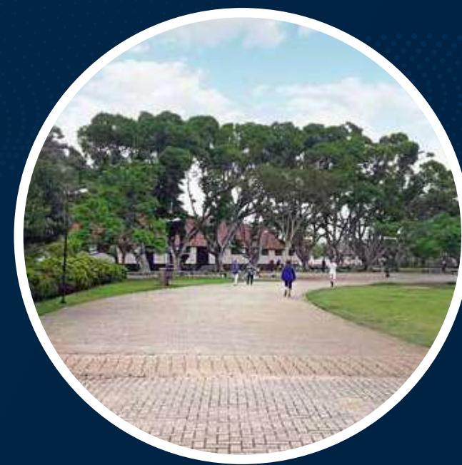
PARQUE DO TROTE