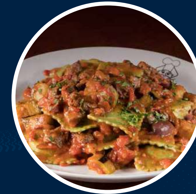
BUONA FATIA PIZZA BAR @ buonafatiapizzabar