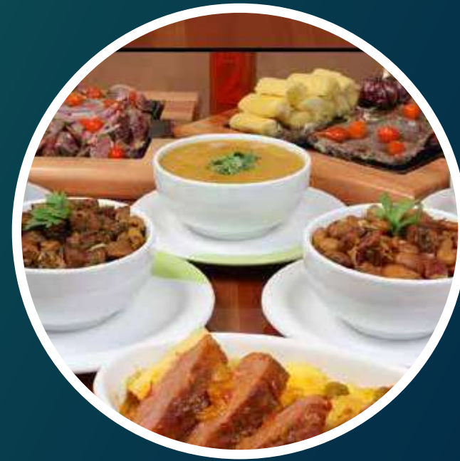
MAGIA DE MINAS