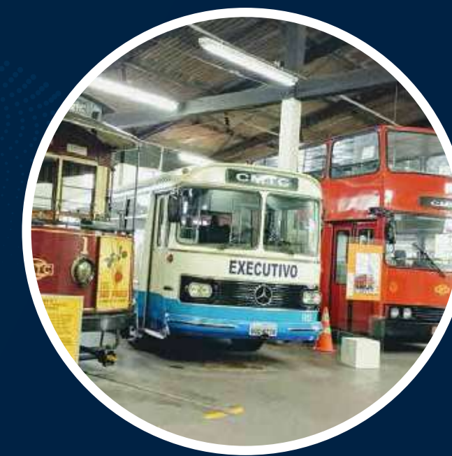
MUSEU DO TRANSPORTE PÚBLICO