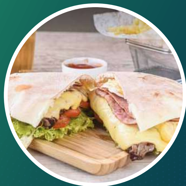
VINIL BURGER @ vinilburger