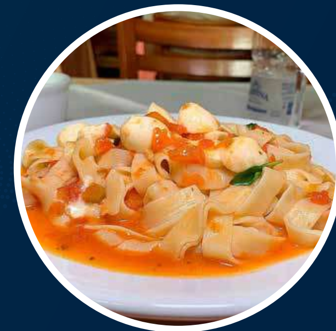
ANDIAMO RISTORANTE @ andiamoristorante