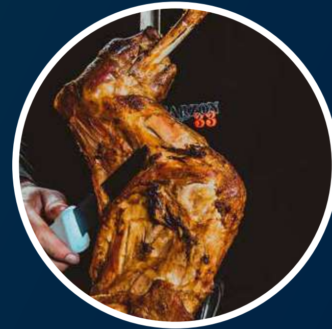
NB STEAK @nbsteak