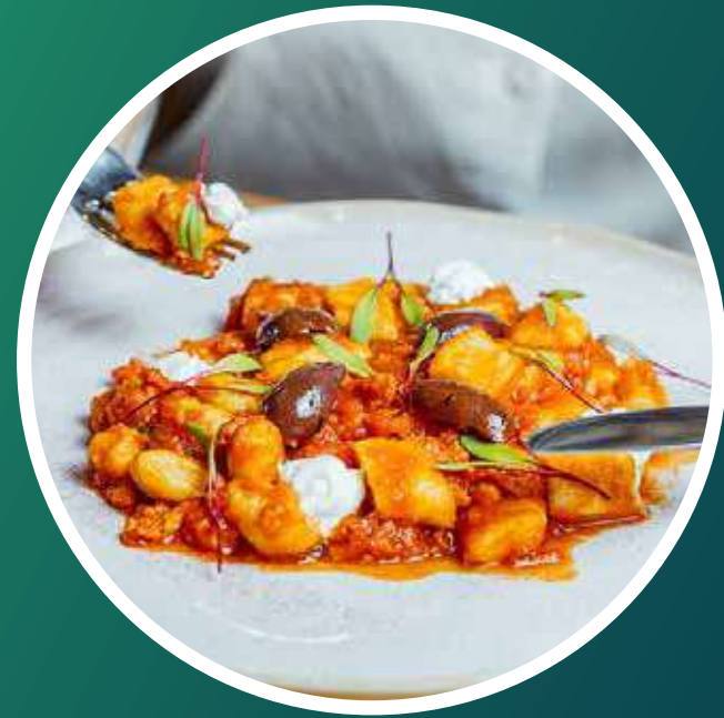
SPERANZA @ pizzariasperanza