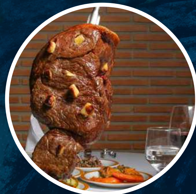
CHURRASCARIA BOIZÃO GRILL @boizaogrill