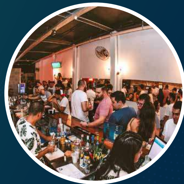
HIGH LINE BAR