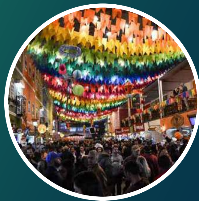
CENTRO DE TRADIÇÕES NORDESTINAS