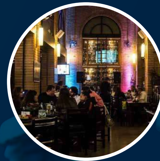
BOTECO SÃO BENTO