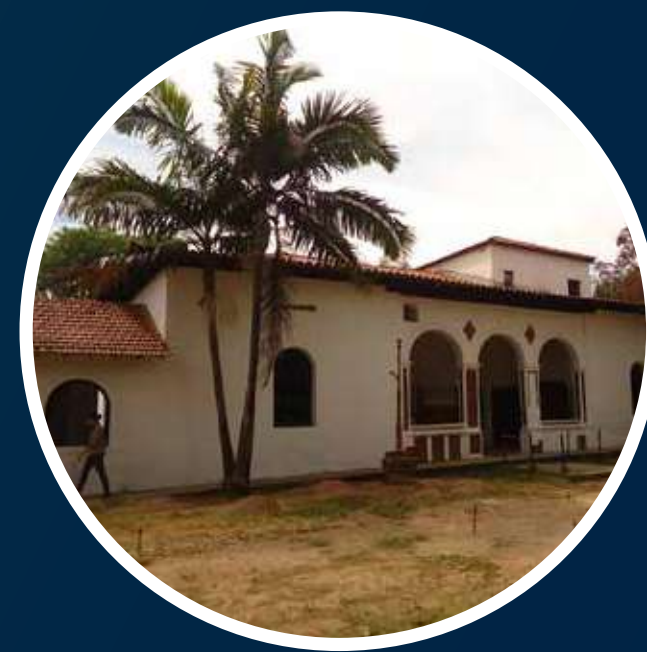
CENTRO DE ARQUEOLOGIA DE SP