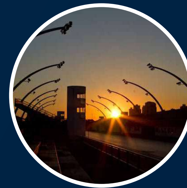
SAMBÓDROMO DO ANHEMBI