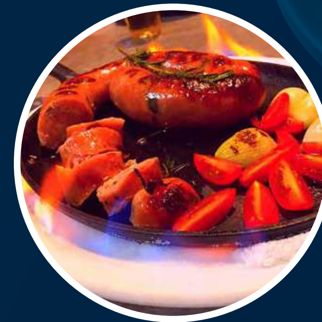
DON MIGUEL MEXICAN BAR @donmiguelmexicanbar