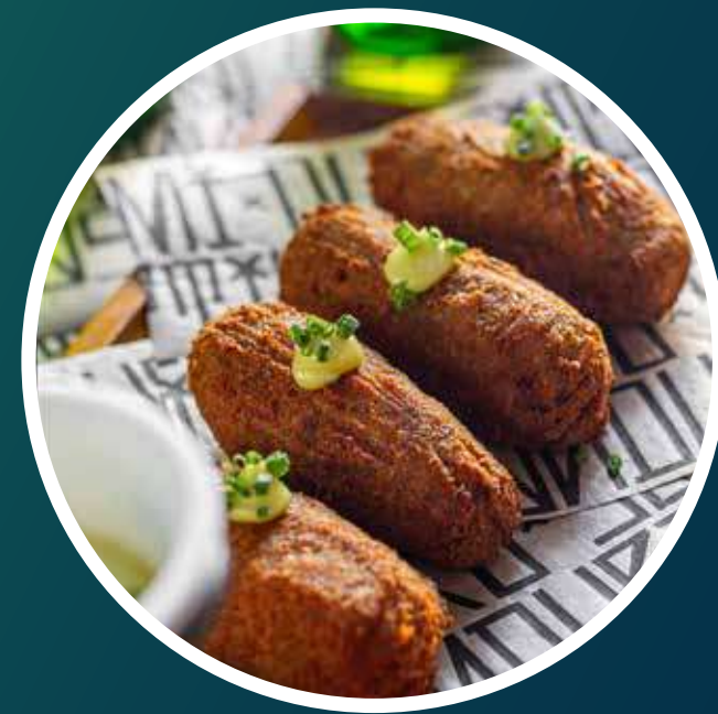
Z DELI SANDWICH SHOP @ zdelisandwichshop