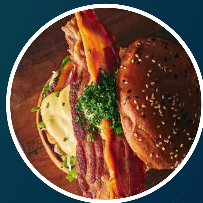
CABANA BURGER @ cabanaburger