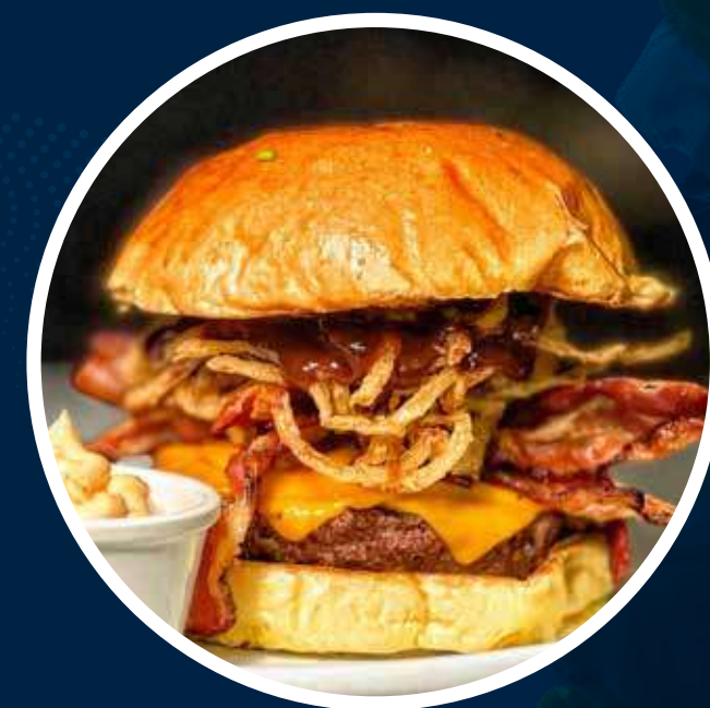
BIG KAHUNA BURGER @bigkahunaburger