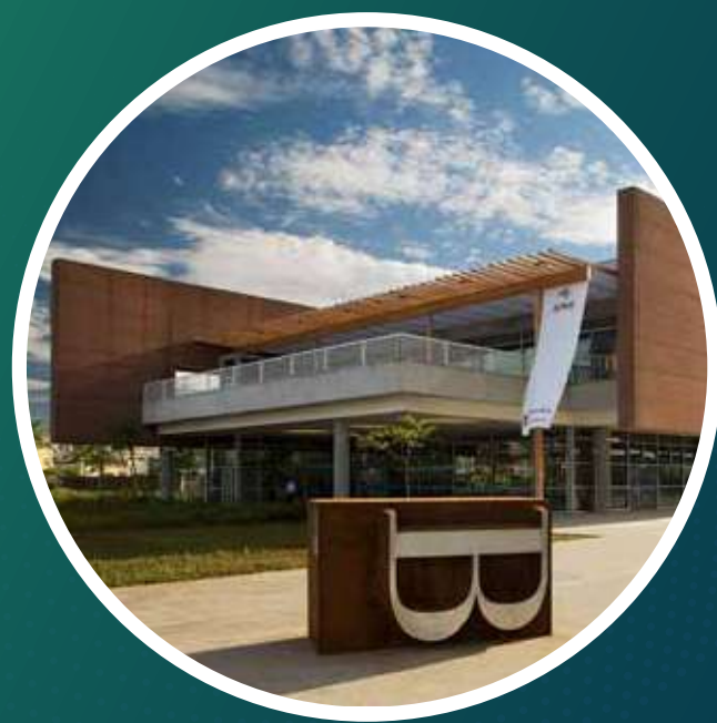
BIBLIOTECA DE SÃO PAULO