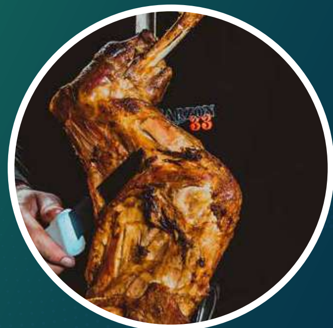
TATU BOLA @tatubola