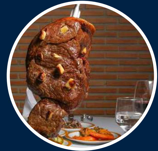
VARANDA GRILL @varandagrill