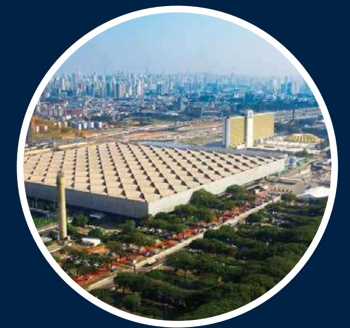
PAVILHÃO DE EXPOSIÇÕES ANHEMBI