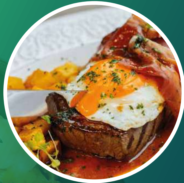
RANCHO PORTUGUÊS @ranchoportugues