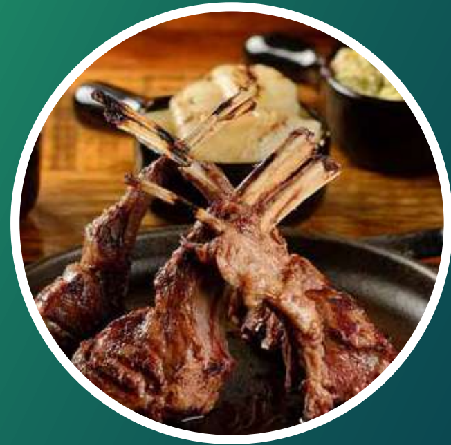
FOGO DE CHÃO @fogodechao