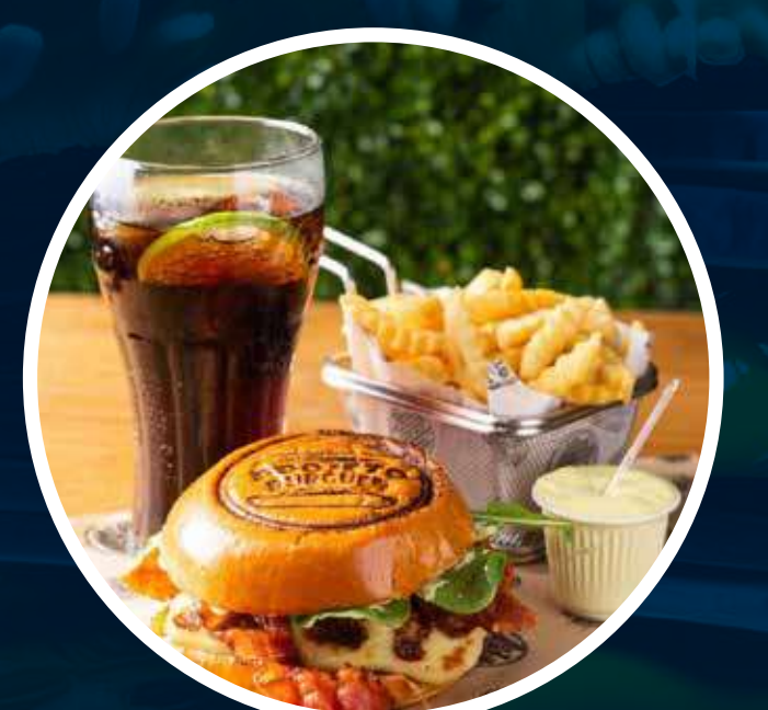
BULLGUER @ bullguer