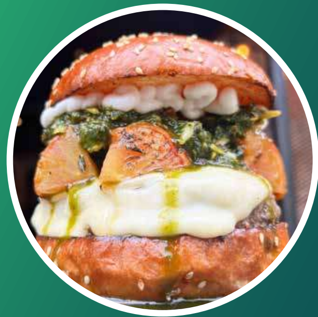
HOLY BURGER @ Holyburger