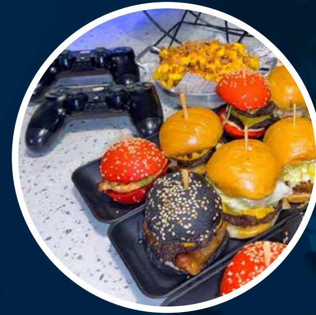
LANCHONETE DA CIDADE @ lanchonetedacidade