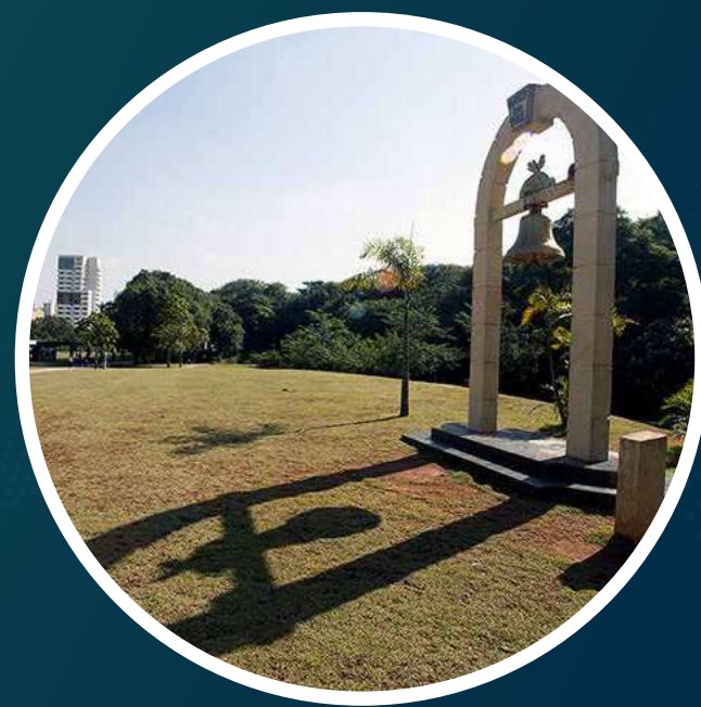
PARQUE DA JUVENTUDE