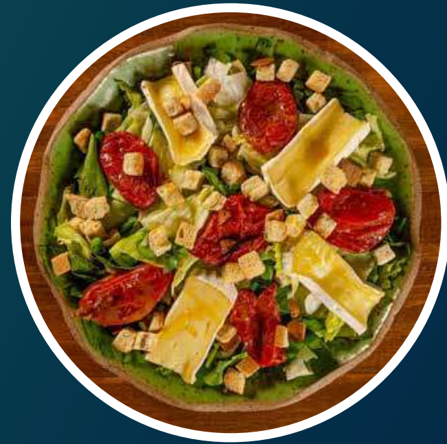
VILLA ROMA PIZZA @ villaromapizza