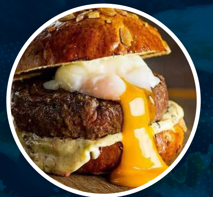
BURGER TABLE @burgertable