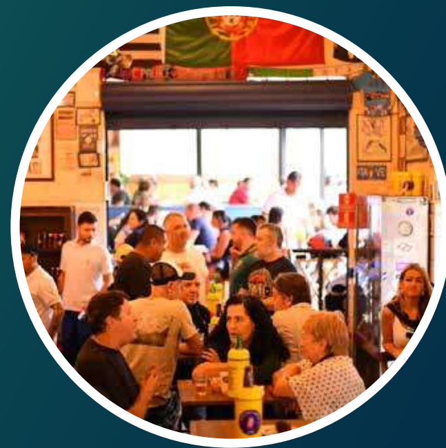
BAR DO JUAREZ