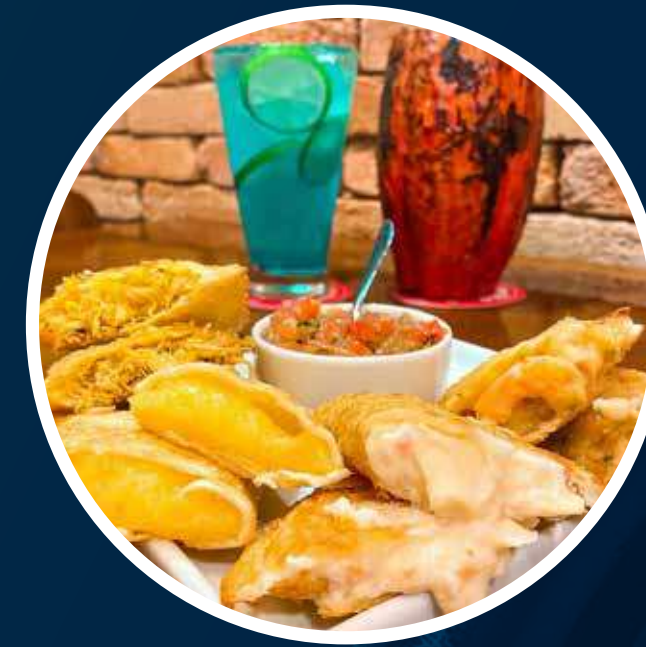
RESTAURANTE MARIA MARIA