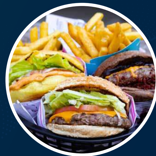
STUNT BURGER @stuntburger